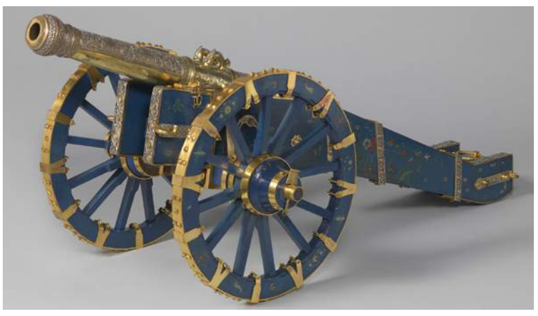
It was agreed this July that the Cannon of Kandy, also known as Lewke's Cannon, will be returned by the Dutch government to Sri Lanka along with other objects

The inscription has been subject to various interpretations and one of the