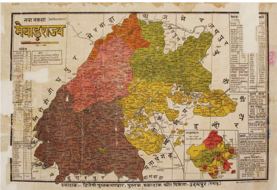
Mewar State (1945), published by Hiteshi Pustak Prakashan, The City Palace Museum © MMCF

Maps of historical kingdoms like Mewar with its boundaries, landmarks, and cultural sites gained in popularity, reflecting the interest in the region's rich legacy. Hindi emerged as a prominent language during India's independence