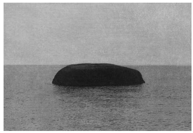
Voice 1 by Jungjin Lee

• Until 13 September, Three Highgate Gallery, London, threehighgate.com